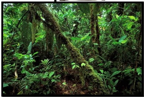
Fig 1. http://replantingtherainforests.org )

Earth Observation Support to Development Thematic Area