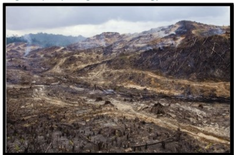
Fig 2. Sarawak Borneo, establishment of oil palm plantation