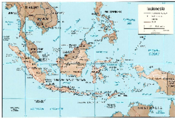
Figure 1: Map of the Indonesian seas

The lack of in situ data in the Banda Sea makes it difficult to gauge the quality of the model representation of 2D structures. As a result, it is often difficult to decide which model to use in a given region in order to get the best representation possible of the ocean. Here, two models are proposed for the representation of the same region, ITF025_G70 LEV, a regional model at \frac{1}{4} degrees resolution and ORCA12, a global model at 1/12^\circ resolution.