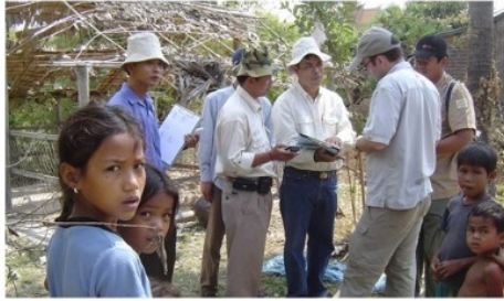
Fig 1. Training of staff from the FA in Cambodia

Earth Observation Support to forest management