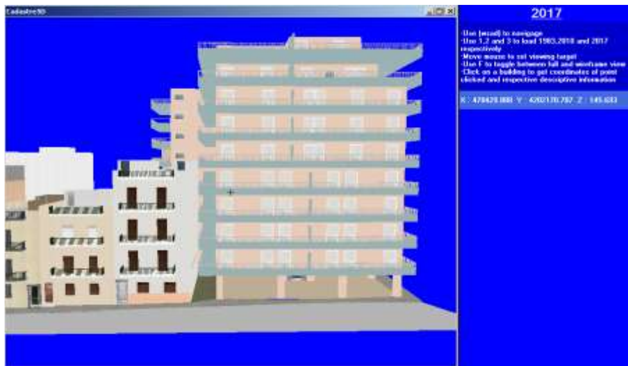
LOD3 in the future time instance (e.g., 2017)