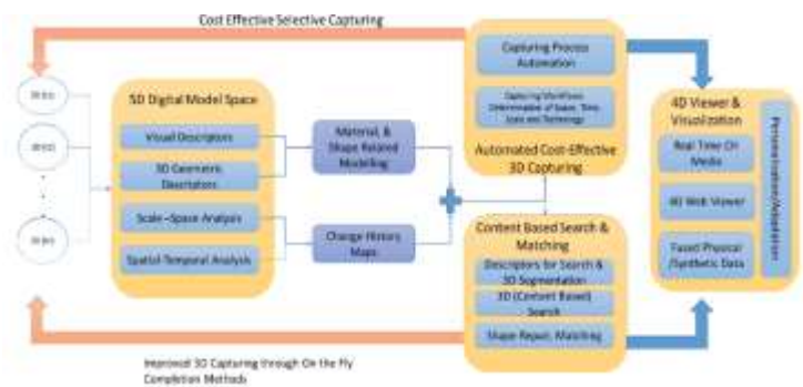
Selective (predictive) 3D modelling architecture