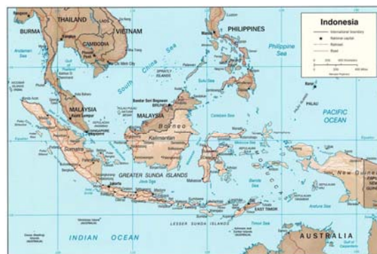
Figure 1: Map of the Indonesian seas

The lack of in situ data in the Banda Sea makes it difficult to gauge the quality of the model representation of 2D structures. As a result, it is often difficult to decide which model to use in a given region in order to get the best representation possible of the ocean. Here, two models are proposed for the representation of the same region, ITF025_G70 LEV, a regional model at \frac{1}{4} degrees resolution and ORCA12, a global model at 1/12^\circ resolution.