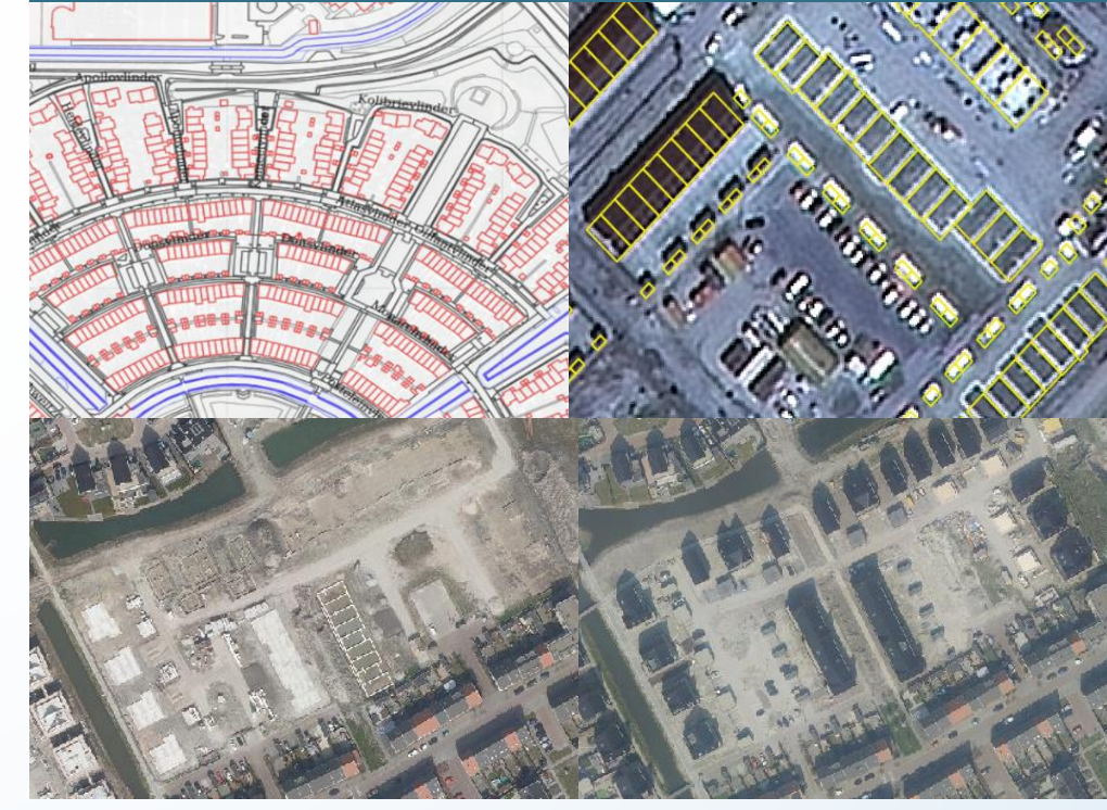
Infrastructure data mapping and change detection

Target 9.1: Develop quality, reliable, sustainable and resilient infrastructure, including regional and trans- border infrastructure, to support economic development and human well-being, with a focus on affordable and equitable access for all.