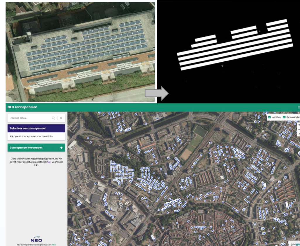
Rooftop solar panels

Target 7.1: By 2030, ensure universal access to affordable, reliable and modern energy services.