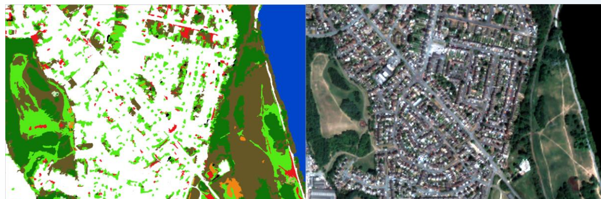
Spottitt 50cm resolution habitat classification Birmingham