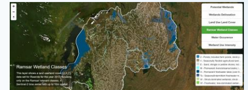
Online map showing the wetland monitoring products for Rwanda