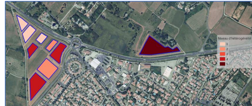
Level of heterogeneity observed in each field

Target 2.3: By 2030, double the agricultural productivity and incomes of small-scale food producers, in particular women, indigenous peoples, family farmers, pastoralists and fishers, including through secure and equal access to land, other productive resources and inputs, knowledge, financial services, markets and opportunities for value addition and non-farm employment.