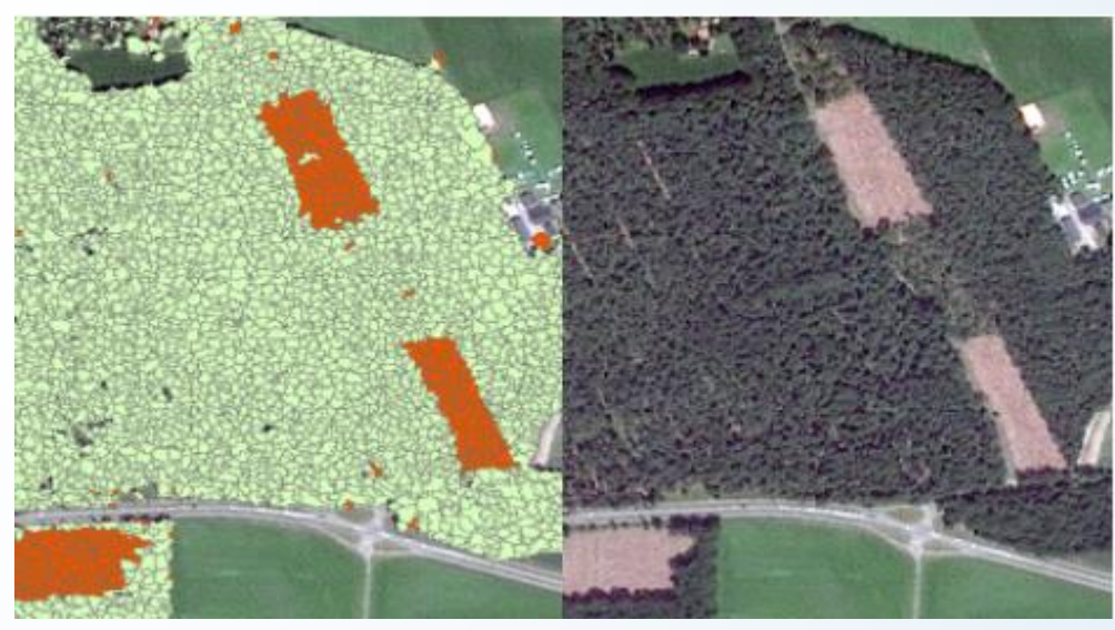
In orange the trees that are signaled as disappeared

Target 15.1: By 2020, ensure the conservation, restoration and sustainable use of terrestrial and inland freshwater ecosystems and their services, in particular forests, wetlands, mountains and drylands, in line with obligations under international agreements.