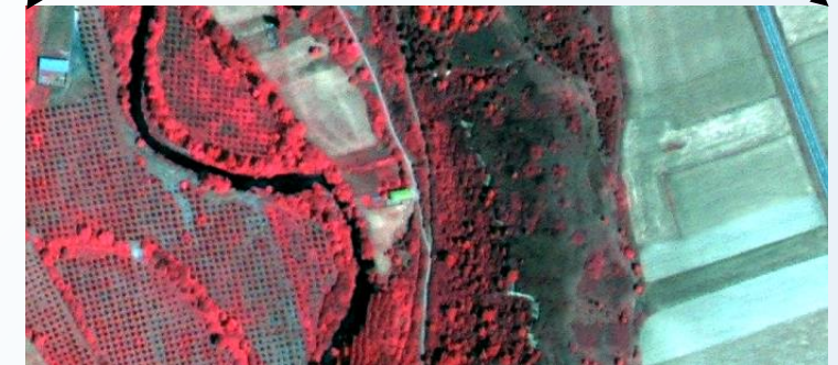
Product MS4 (R,G,B, NIR) 0.4 m