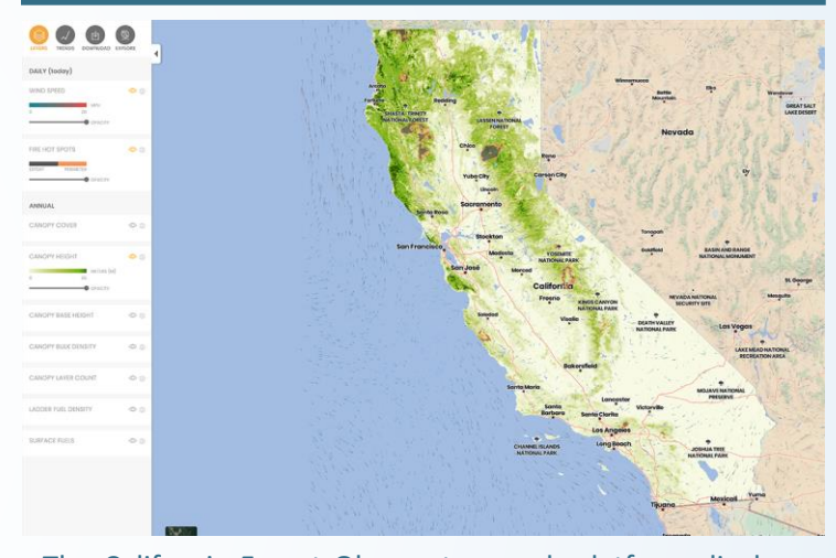
The California Forest Observatory web platform displays trends across space and time.