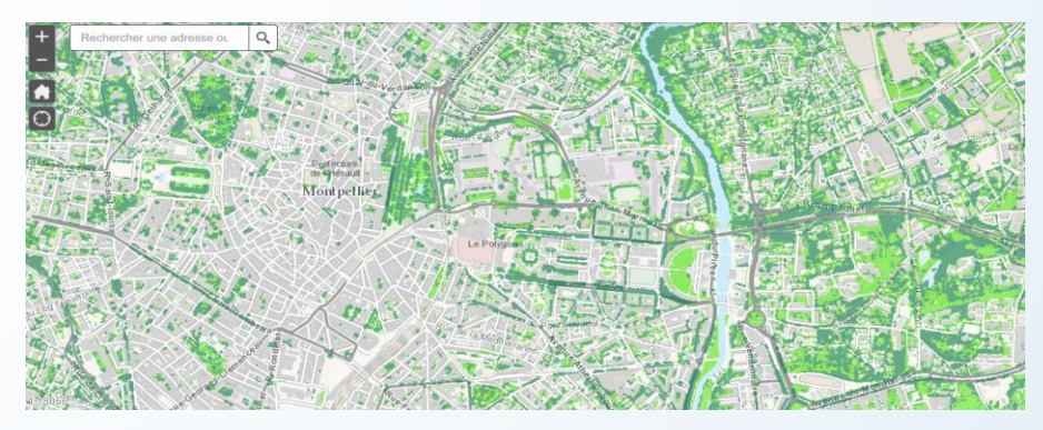
High-detail vegetation mapping, Greater Montpellier area