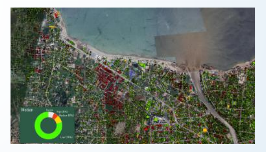
Figure: Rheticus® Building Check service geoportal with analytics tools

Target 9.1.: eo services based on Inform on infrastructures development & planning. Target 11.5.: eo services based on Mapping of vulnerable disaster areas & early warning systems