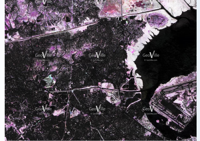
Urban area monitoring Brazil (Top - Rio de Janeiro; Bottom – Sao Paulo)

Target 11.1: By 2030, ensure access for all to adequate, safe and affordable housing and basic services and upgrade slums.