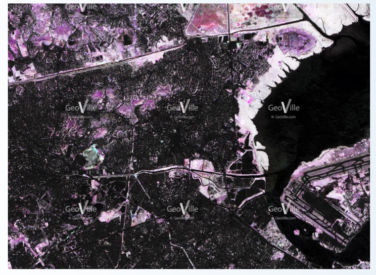
© Urban area monitoring Brazil (Top - Rio de Janeiro; Bottom - Sao Paolo) Copernicus Land Monitoring Service, European Environment Agency; processing by GeoVille