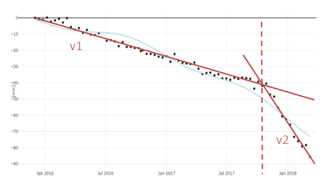
Figure 2 Cadia mine tailings dam failure in Australia

indicate the rate of movement. In the case of red, the dam is subsiding with more than 2 cm/yr, in the case of green the location is on average stable over time. To better understand these data, it can be inspected more closely from the underlying time series. Each polygon can be interrogated by the user to assess movement at each location on the dam wall. The picture in Figure 2. Error! Reference source not found. demonstrates how this section of the dam wall has subsided with more than 8 cm in 2 years. Depending on local conditions this can be a normal pattern for such a structure. However, when inspecting closely the area of the collapse in the InSAR time series data, a dramatic increase in subsidence rate from v1 to v2 was seen around November 2017. This was nearly 4 months before the collapse and was potentially a significant leading indicator that could have alerted the operator of an imminent failure.