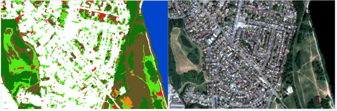
Spottitt 50cm resolution habitat classification Birmingham