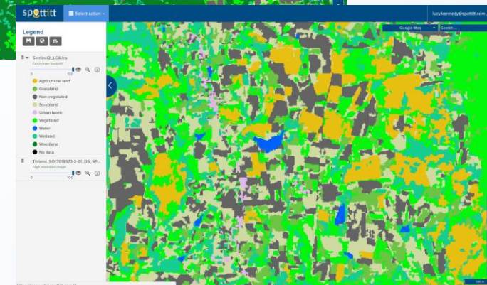
Spottitt 10m resolution habitat classification Thailand