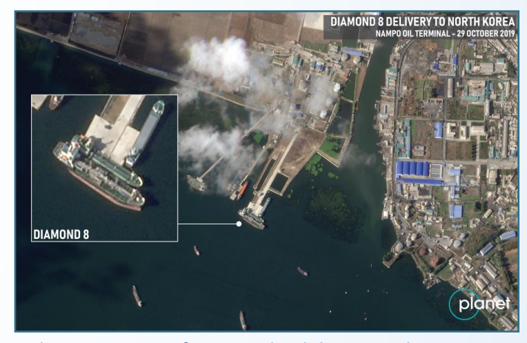
SkySat imagery of Diamond 8 delivering oil at Nampo Oil Terminal in North Korea